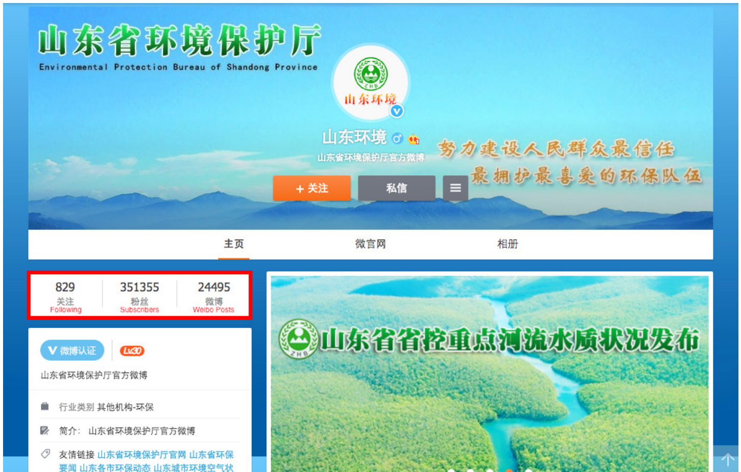
Figure 1. Screenshot of the Shandong provincial Weibo account. The figures highlighted in the red box track the number of followers, subscribers, and the account's Weibo posts (box and translations added by authors).