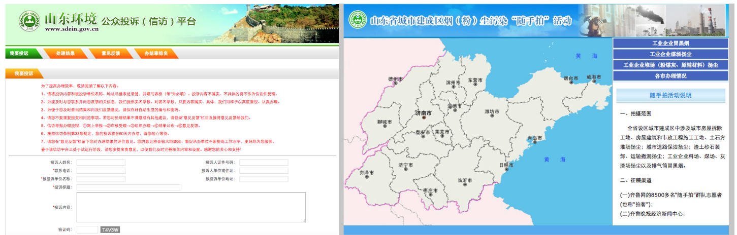
Figure 2. The Shandong provincial Weibo account provides public environmental information and updates. For instance, the account redirects users to an environmental petition platform xlii (above left) and smoke dust emission reporting platform xliii (above right).